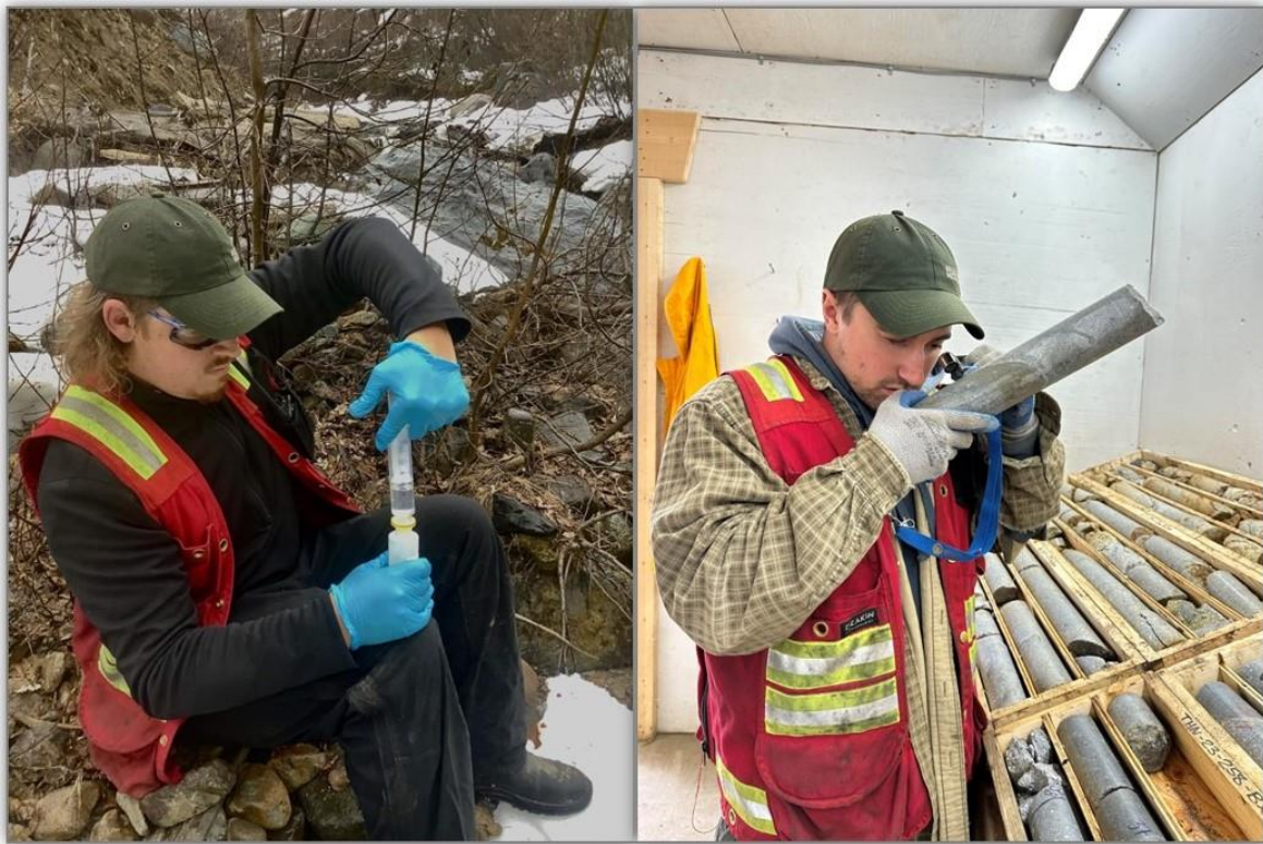
Figure 3. Water Sampling at Camp Creek and Core Logging.